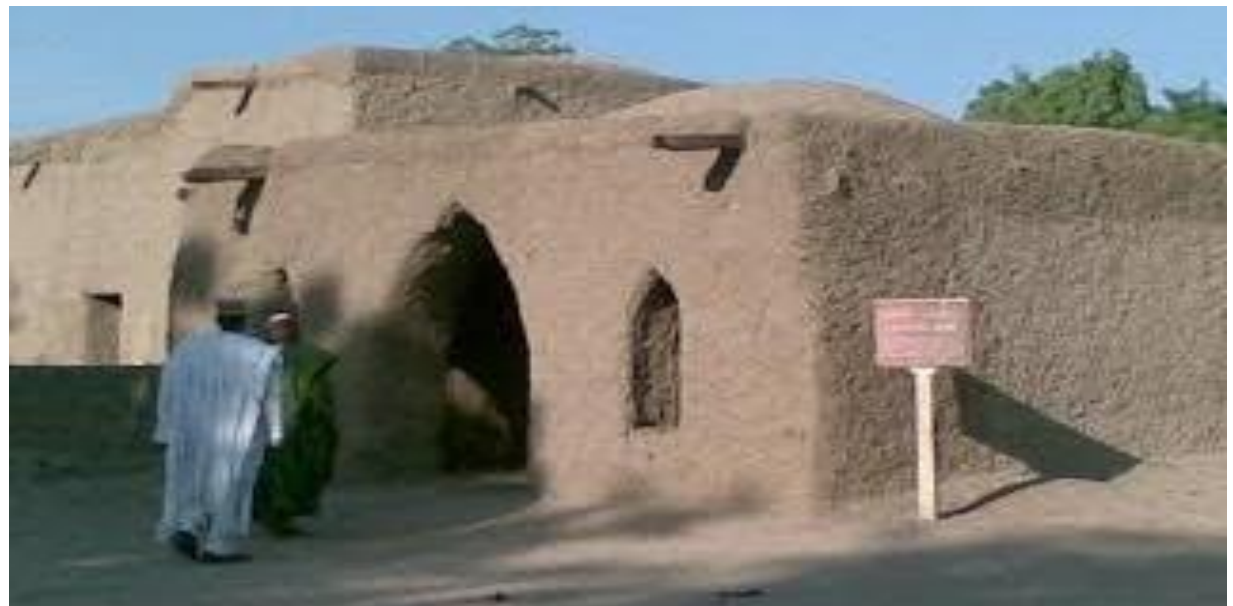
Figure 3: Main Entrance of the Palace: Tourists entering the Palace before the advent of Boko Haram Insurgency