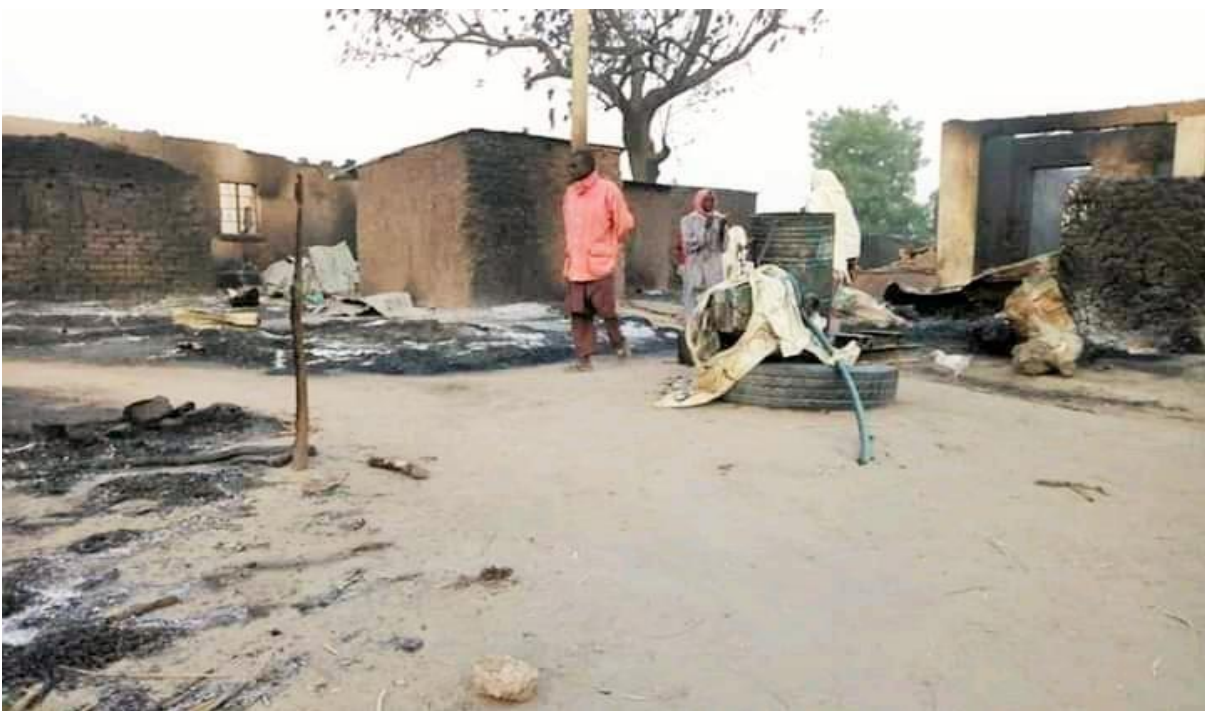
Figure 6: Community destroyed: These are some of the houses that Boko Haram has burned, and people are stranded and homeless in the community during the visit