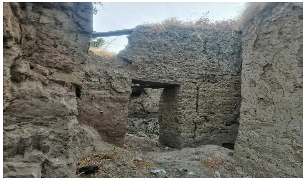
Figure 5: Dilapidated Part of the Building; This is one of Rabeh ibn Fadhallah's quarter guards located within the parameter wall