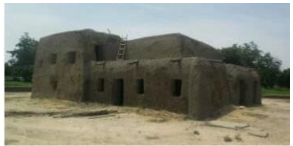
Figure 9: Outer image of the main Palace of Rabeh ibn Fadhallah before the attack