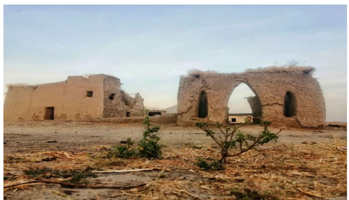
Figure 4: Main Entrance of the Palace: The main entrance of Rabeh's Palace after the destructive attack by the Boko Haram insurgents