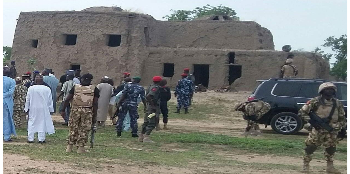
Figure 2: Main Building: during the visit by the government delegation

The Palace contains various sections such as Rabeh's main Palace, his wives, his concubines, children, quarter guard, courtyard, prayer room, assembly ground, security tower, and tollgates all built and surrounded in the mud. Sadiq (2019) posits that the traditional method of architecture was traced back to the Sudan method of building one of the most common and captivating mud buildings in sub-Saharan Africa. During the reign of Rabeh, precautionary measures are put in place to impend danger against him. According to oral tradition, Rabeh has more than two hundred guards within the Palace to guard him and his immediate family; recently, the site has remained the target of insurgents. The first attack launched destroyed part of the parameter wall, which resulted in the deterioration of the mud wall and the building structure. The sect left some of the structures untouched; however, most of the buildings were in deplorable condition. A government delegation visited the heritage site after the attack. According to the report, no tangible or valuable items except the dilapidated structure are left behind. The Bombs and massive destructions caught the attention of the national community, but this couldn't deter them from their ongoing campaign against the state. Unfortunately, no measure(s) is taken to safeguard cultural properties in times of crisis.