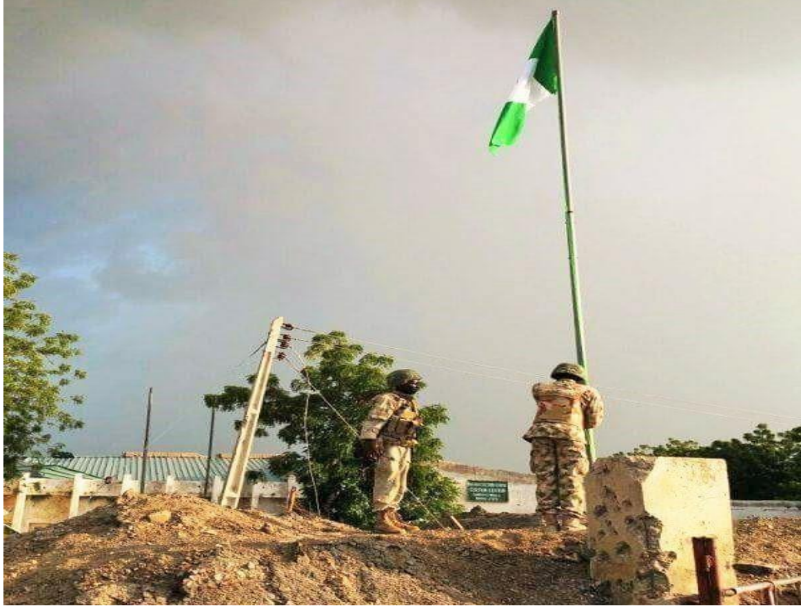
Figure 12: Nigerian Army remount Nigerian Flag: This is recaptured town of Dikwa community by the Nigerian Army in late 2015 when a heavy exchange of fire took place between the two forces.