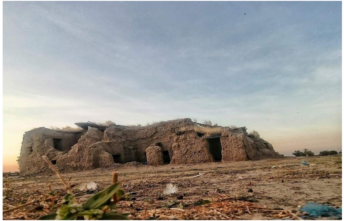
Figure 10: Outer View of the Palace site after the attack by the insurgents