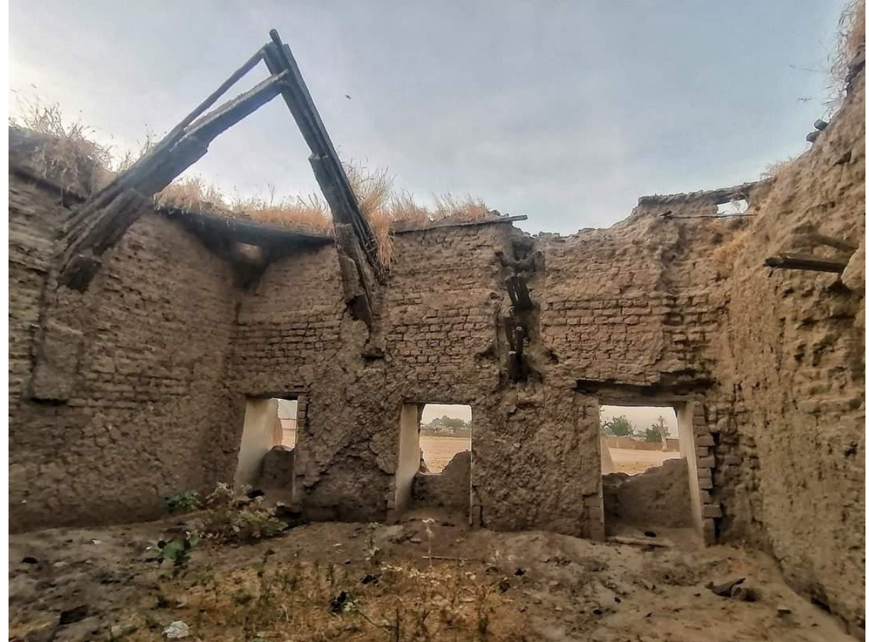
Figure 11: Total collapsed: looking at the structure and collapsed roof of the Palace exposed the dilapidated building into other elements of destruction

The main Palace is a mud-story building with one room upstairs and two big rooms down the floor. The insurgents blew up the Palace with an armored tank that manifested a huge crack in the inner walls, holes, and a total collapse of some parts. The extreme vandalism of the historical monument that serves as a memorial place became devastating and lost the aesthetic presentation of the design and pigment.