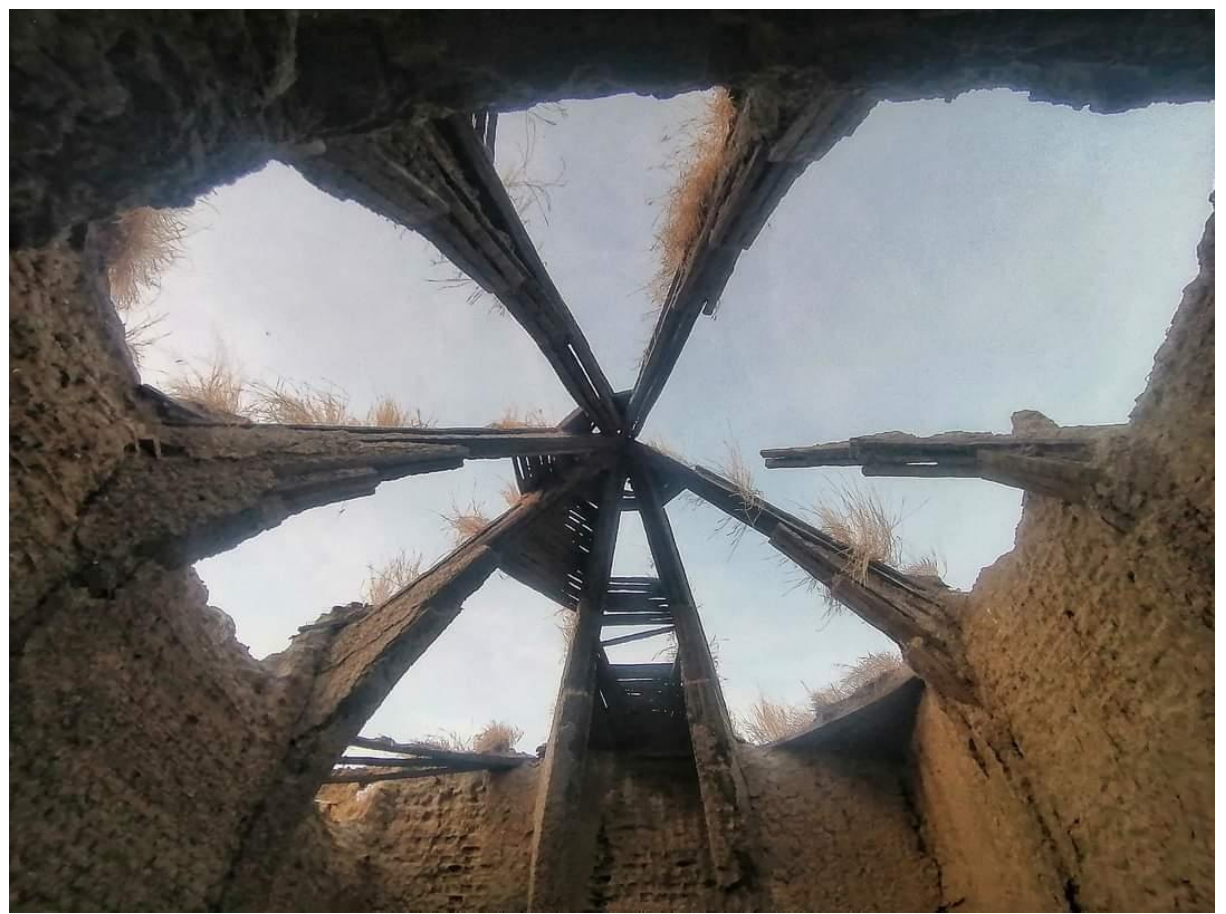
Figure 8: Condition of the Monument after the attack