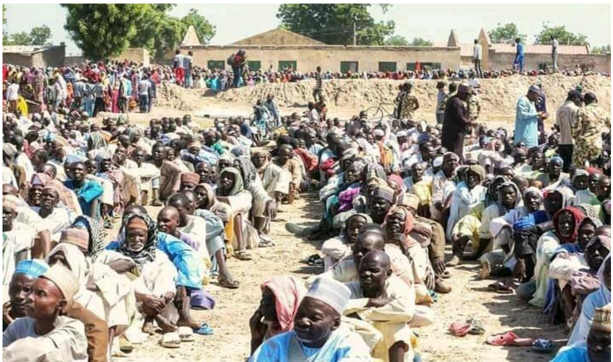
Figure 7: Internally Displaced Persons (IDPs)

town was disastrous, and the entire community looked scanty. The Dikwa community deserted, disrupted, and disordered leaving the people in dismay at the sudden situation. The community members and several cultural organizations tried to re-establish the cultural identity and sustain places of memory associated with history. Still, the cruelty of the insurgents aggravated the assault on them. This attack on cultural properties left a deeper impact on the communities associated with historic monuments and heritage sites. It alters people's cultural identity and their relationship with the traditions and creates a widening gap between generations by producing new practices and belief systems.