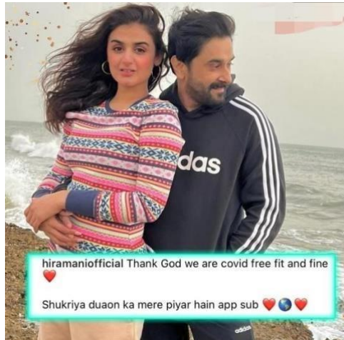
Figure 4. Instagram Post (Hira Mani, hiramaniofficial).

The mentioned Figure 3 presents the prepositions are limited or less in number, but they perform an important marker in making sentences. They create relations between objects, persons and locations. The absence of prepositions in a sentence not only destroys its structure but also gives wrong semantic expression too. Most Pakistani celebrities do not use prepositions while writing or skip the accurate usage of prepositions.