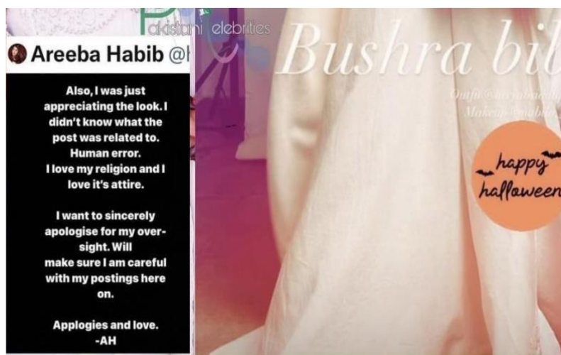
Figure 5. Instagram Post (Areeba Habib, imareebahabib).

Figure 4 expressed that the marks 'full stops' 'commas, and brackets are the punctuation marks. These are essential elements to clear up the meaning of a sentence. Improper use of full stop with no knowledge of the real essence of these marks is another syntactical flaw' projected by Pakistani celebrities in their Instagram posts. Full stop gives completion to sentence. Improper use of full stop with no proper knowledge of the real essence of these markers is another prominent issue of errors commission or happening. The full stop is used to end up the sentence.