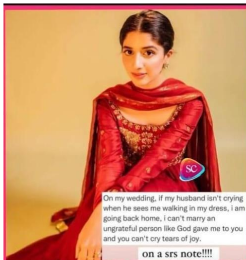
Figure 9. Instagram Post (Mawra Hussain, mawrellous).

We can clearly see the errors in Figure 8 formed sentence structure gives another reason for most of our Pakistani celebrities' errors. Sometimes they pick up words and accumulate them in the wrong order. Vocabulary selection for making sentence is very important.