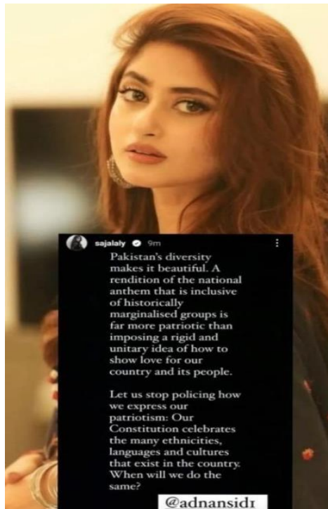
Figure 8. Instagram Post (Sajal Ali, sajalaly).

The Figure 7 gives another error, which is frequently done by few of our celebrities is subject, verb agreement errors. Verb should be according to the subject. If subject is in pluralized form, then verb should also complement the subject.