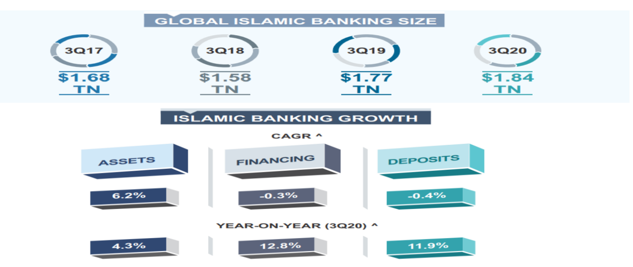
Figure 1. Global Islamic Banking Size.