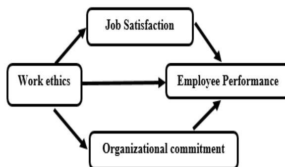
Figure 1. Research framework.

Houghton et al. (2015) defined a conceptual framework as a diagram or written product, one that describes the important key factors, concepts, or variables and the assumed relationships between them and explains either graphically or in description form. There might be various aspects of any research and different linkages; the conceptual framework gathers the important and particular factors of the study, limits them, and shows as a design to help to stay within the research dimensions. Hence, this study observed four variables, which are conceptualized in the framework as follows (Figure 1).