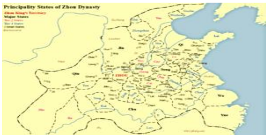
Figure 1: Map showing major states of Eastern Zhou

At first Qin started a military mission in China in 672 BC, it is true that it could not connect in stern incursions because there was hazard from neighbor tribes. In the very start of the fourth century BC, the neighbor had been cowed or some had controlled so the condition was ready for the climbing of Qin expansionism (Guo, 2009; Tan, 2017; Zhao, 2013).