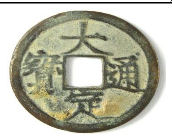
Figure 3: Shape of copper coin